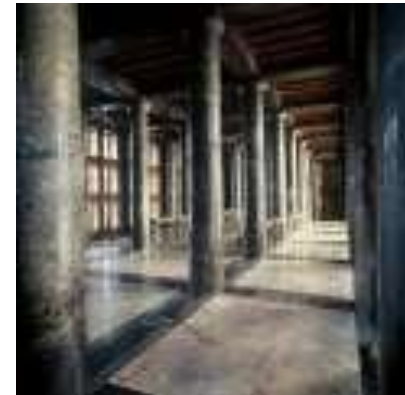
The National and University Library of Slovenia (NUK)